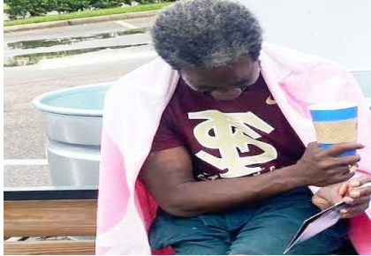
Weeping and wet, but saved, a man reads a tract given to him.

It appeared that Wal-Mart security would thwart the mission, but God had it arranged. Security drove by, saw what was happening and just continued on.