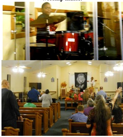
People in worship

"V<sub>7-11</sub> explains further, 'To each is given the manifestation for the good of the whole body. For one is given through the Spirit the utterance of wisdom, and to another the utterance of knowledge by the same Spirit, to another faith by the same Spirit... ... all these empowered by one and the same Spirit, who apportions to each one as he wills.' It is as God wills. We have to stop trying to do God's business, and just follow him and do what God wants us to