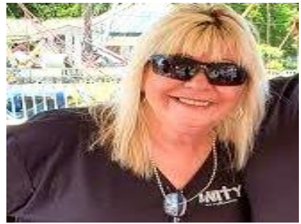
Author Rock Shunk

organization and all donations are completely tax deductible .