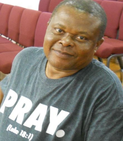
could see if the quarterly meeting during the seven-day revival has a good response and take it to a monthly meeting.

We should use one of the days of the sevenday revival as a meeting for the whole alliance. If the virus is going to continue to be a problem, we can plan for the future. We also need to have money so the alliance can do things like pay rent for a main office or pay the speakers. We need to have a second bank account, not just the account for the Battlefield News, but one for the alliance, We