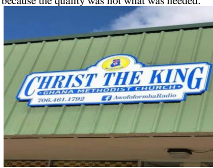
The sign over Christ the King Ghana Methodist Church

beautiful and very befitting of the sanctuary of King Jesus. The church, at its founding, moved to Winder on East Athens Street in December of 2012, but relocated to its present location on Palm Sunday of 2014. A sign was raised in front of the church at its new location that served the people of Christ the King for a season, but within no time, that sign wore out because the quality was not what was needed.