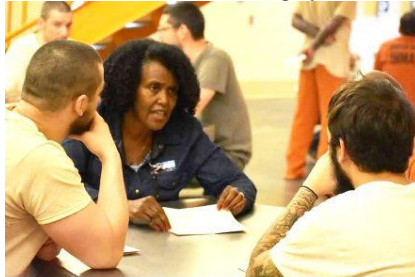
Visiting and witnessing

There were 98 first time salvation decisions, 176 rededications to the Lord and 96 prayers of