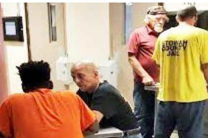
At Etowah County Jail

to pray for the Fly Right Ministry teams as they continue to work tirelessly for the Lord.