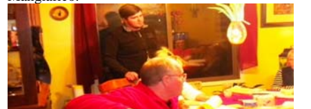
Kingdom decisions being made around the dining room table by servants of Christ