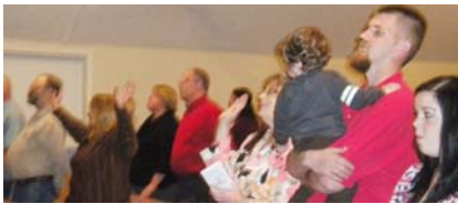
God's people in worship