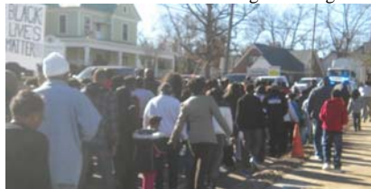
The marchers began at Quality Food in Winder and marched through the town to end at White Oak Springs Missionary Baptist church.

On 19 January, the day we all celebrate the birth and works of one this nation's greatest men, the reverend Dr. Martin Luther King. This began