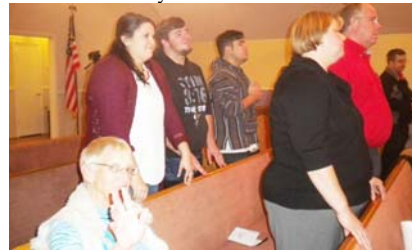
People in worship

get sidetracked. We must seek grace for this. Denominations have a place and many began out of great need. The division is not necessarily along denominational lines. I believe the problem is when a spirit of elitism comes about and exclusion of other fellowships develops a spirit of competition. This is what Satan wants because it keeps us from pointing everything to Christ. I might not necessarily appreciate your style of worship, but if it is reaching people, I must honor it. You might understand a Van Gogh and I might not, but this does not invalidate the value of the painting.