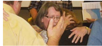
Ms. Debbie Reynolds prays (no, really)