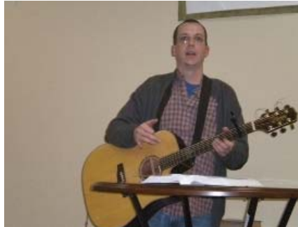
Of Bible knowledge I sing

3: What soldier was anointed king of Israel by one of Elisha's followers?