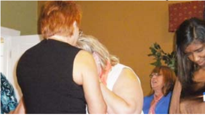
Prayer over certain women