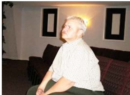
That light around my head comes from reading Bible Knowledge in the Battlefield News