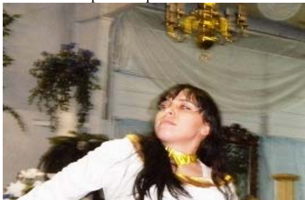
How dare you take my Bible knowledge?