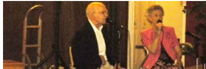
Daddy sang the song that he wrote, Land Beyond the End of Time

Straitway performed a special request for Celebrate Me Home .