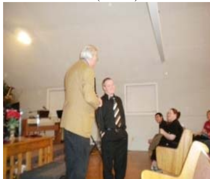
That's right, I owe it all to Bible Knowledge in the Battlefield news