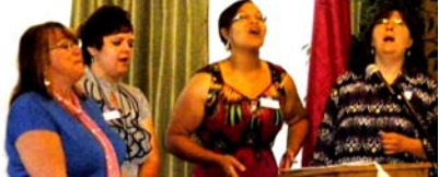
The New Walk Praise Team