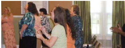
Women in worship