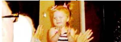
Irresistible photo opportunity