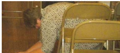
Many women worshiped on the floor.