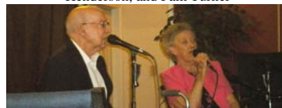
Daddy & Momma