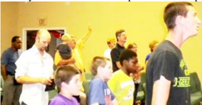
Some of the people in worship