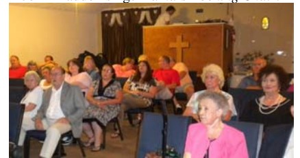
Some of the people enjoying the Benefit concert for the Battlefield News.