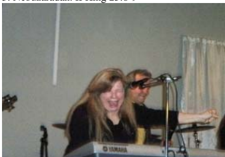
I can't stand it. Give me more Bible knowledge