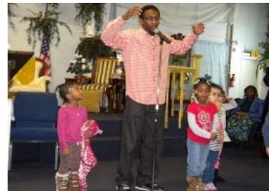
These are the Bible Knowledge kids

8: During the reigns of David and Solomon, Tahpenes was the queen of what country?